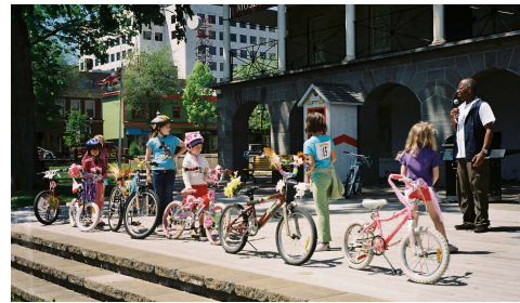
Best-dressed bike contestants!