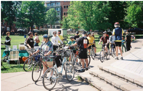
40K group preparing for departure

After such a positive first-time experience you may be sure this event will be repeated next year - watch this space!